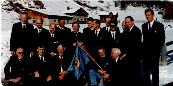
Slovenian Mountain Guides delegation and IFMGA EC committee upon acceptance into the IFMGA in Kals (Grossglockner) of the 22nd of February 1997

After the second world war the mountain guiding in the area was managed by the mountaineering and alpinism committee within the Sport Association of Slovenia and later, by the Mountain Guiding committee within the Alpine Association of Slovenia (AAS). At the time, mountain guiding was mostly performed as a voluntary activity and was regulated by internal rules of the AAS. However, inside the guiding community a need and desire for a professional guiding association was growing. Finally, the founding assembly of the Slovenian Mountain Guides Association (SMGA) was held on the 26th of May 1993. The SMGA was organised as a society and was a member of the AAS. After application and the candidacy period, the SMGA became full member of the International Federation of Mountain Guides Associations (IFMGA) on the 22th of November 1997 in Kals (Grossglockner).